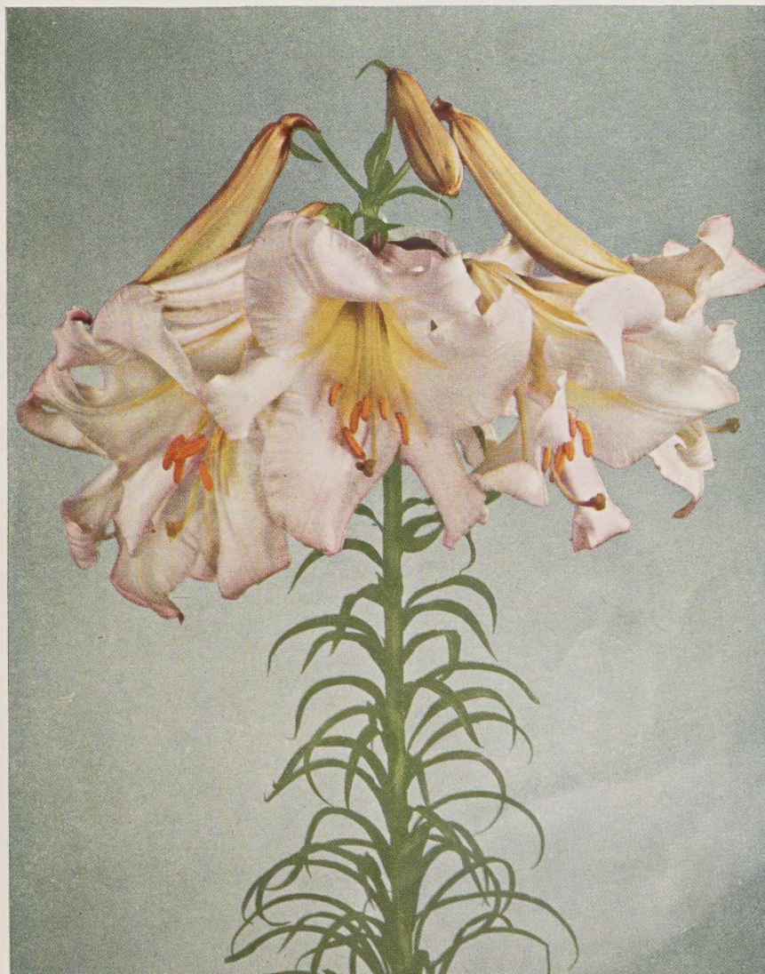
L. CENTIFOLIUM HYBRIDS